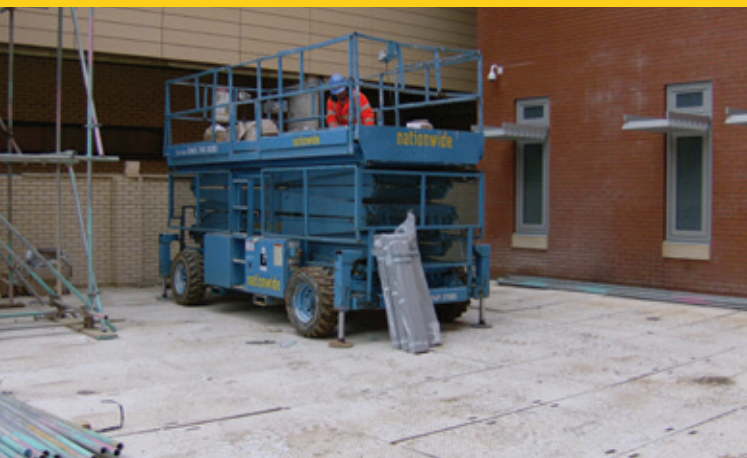
Protecting 600-year-old courtyard stone