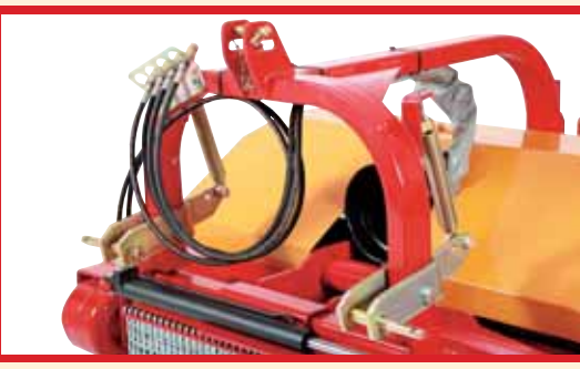
Displacement to both sides, balancing device on three-point linkage frame for low ground pressure