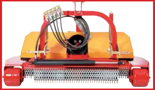
BV in front view