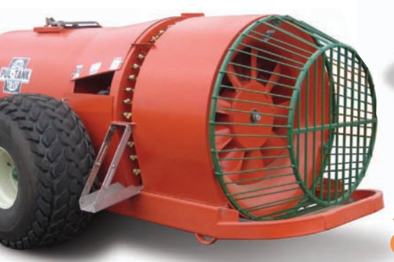
heavy fan screen with 38" fan

Changing fans is a quick, ten minute job- including removing and reinstalling the fan grill.